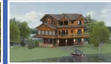
To be built on Sunset 8, 9 and 10.

Imagine boating, skiing, fishing, sailing, canoeing, and swimming on 500 acres of pristine water surrounded by gigantic white pine. The park-like setting surrounding the lake provides an attractive timeless atmosphere. Most visitors compare NEPCO Lake to a lake you would only expect in Ontario, Canada, not in central Wisconsin. Don't take our word for it. One of the Midwest's outboard motor manufacturers filmed its commercials on NEPCO Lake in the 1970's. The commercials referred to NEPCO Lake as a Canadian Lake.