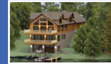
To be built on both East Shore 77 and 78.