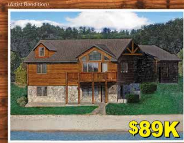
Price is for home (shell) only. Land is separate and starts at $50k.