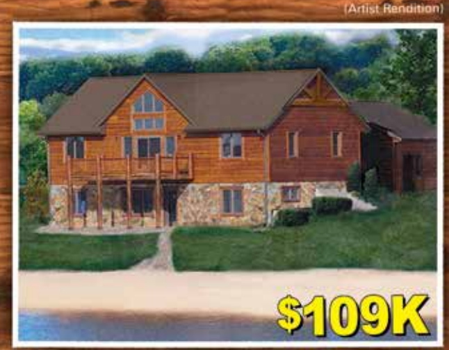
Price is for home (shell) only. Land is separate and starts at $50k.