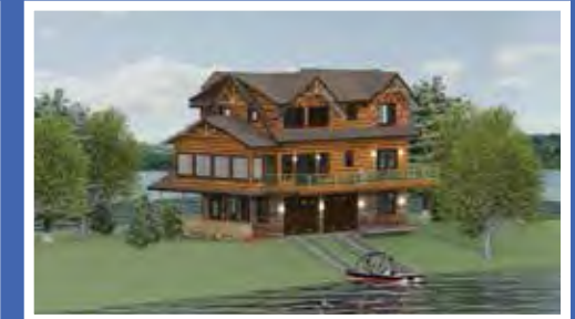
To be built on both East Shore 77 and 78.